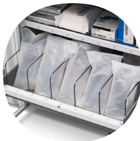
XT Pull-Out Shelf