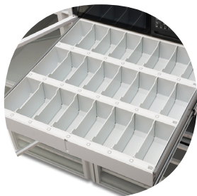
XT Supply Drawer