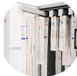
XT Supply Rack